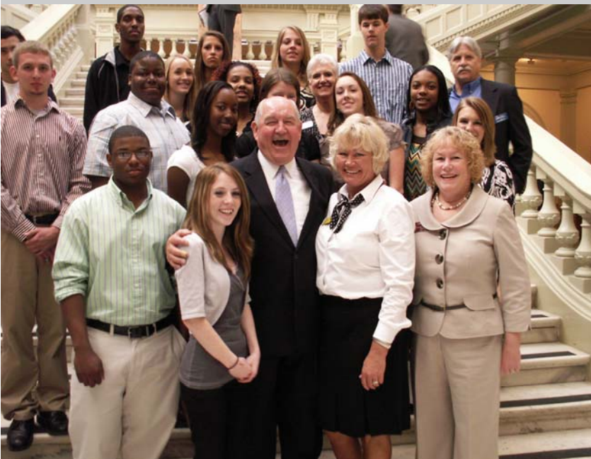
State Capitol Trip Photo with Gov. Sonny Perdue