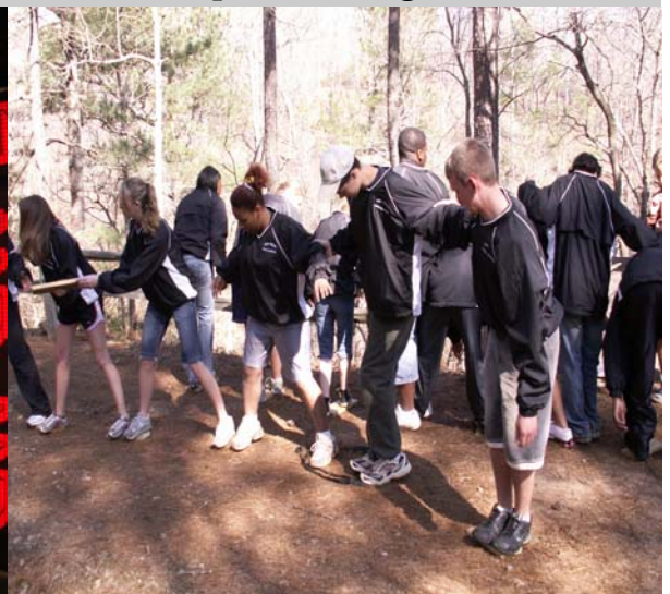
Trip To Banning Mills